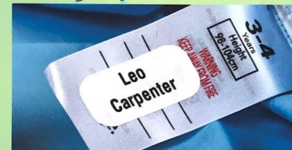
Only apply Stikins onto the wash-care label of clothes, never directly onto the fabric or any other label.

Fundraising Number 8384 If your school has a fundraising number, please use it when you order. (Schools earn 30% commission)