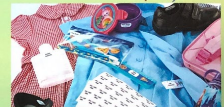
One easy name label with multiple uses for all kinds of personal items, including clothes and shoes.

Please follow the instructions for use on the bag.