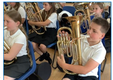
Year 5 Brass