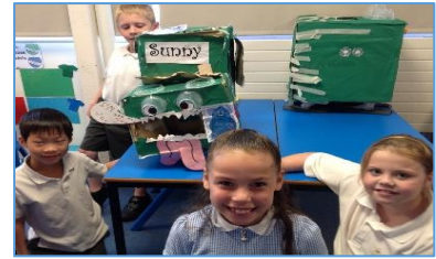
Year 3 Recycling Monsters