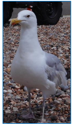
Year 1&2 Trip to Littlehampton