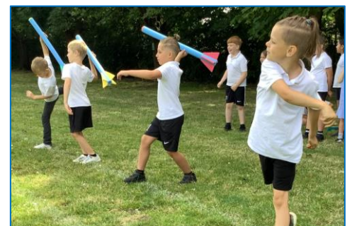
Year 3&4 Chocolate Olympics